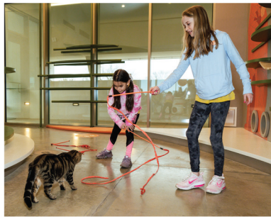
Potential adopters spend time in open spaces with the adoptable cats.

In March, Best Friends Animal Society introduced a new animal resource center in Bentonville, Arkansas, that changes the traditional sheltering model as we know it. The first-of-its-kind national destination for animal lovers, Best Friends Pet Resource Center showcases adoptable pets in a bright and airy facility that does not use cages or kennels, instead housing them in large, open rooms or utilizing their local foster network.